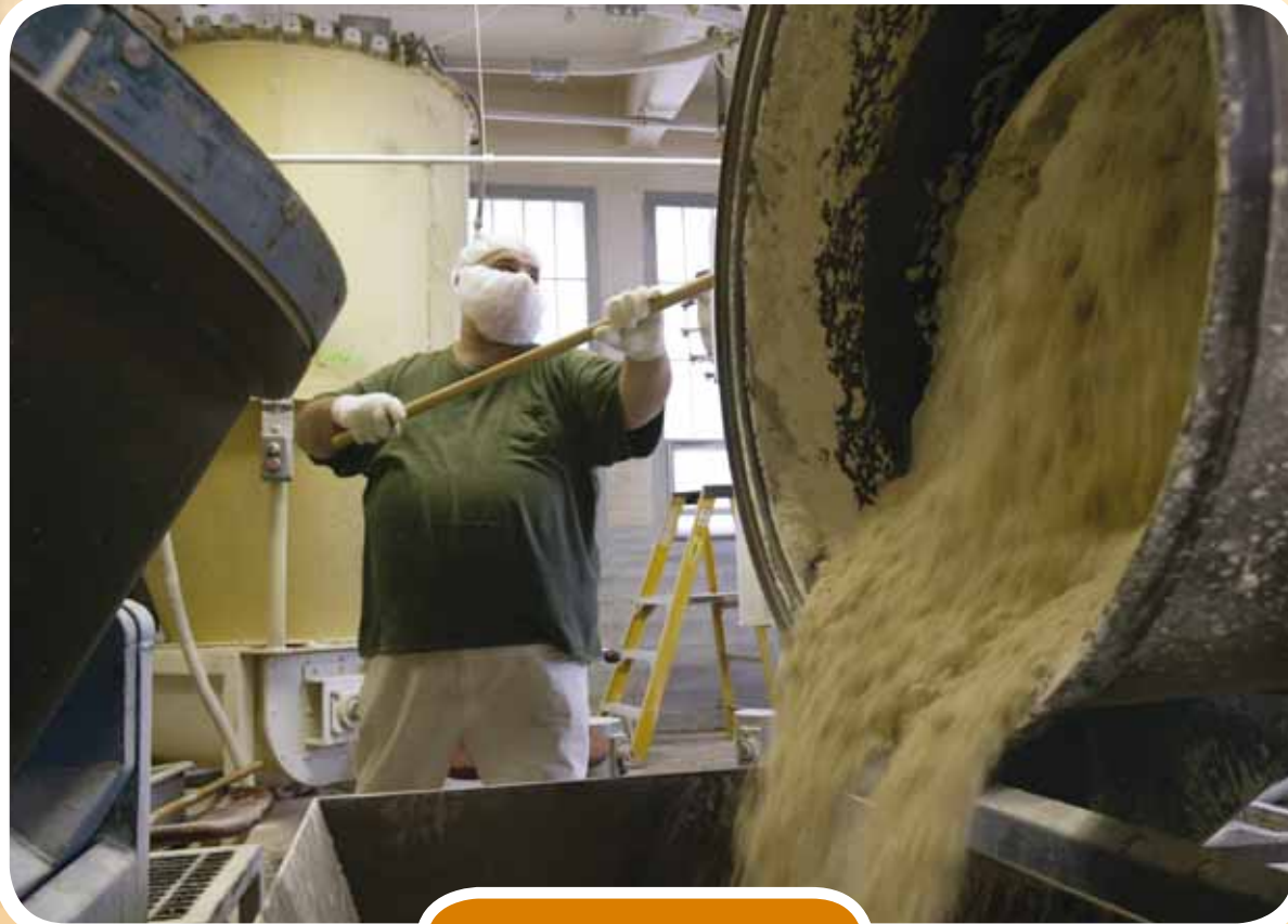
A worker at a flour mill

Wheat flour is made from ground-up wheat. Long ago, people used stones to grind the wheat into flour. Today, the wheat is sent to mills and is turned into flour.