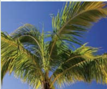
↑ Leaves can be found in many shapes and sizes.