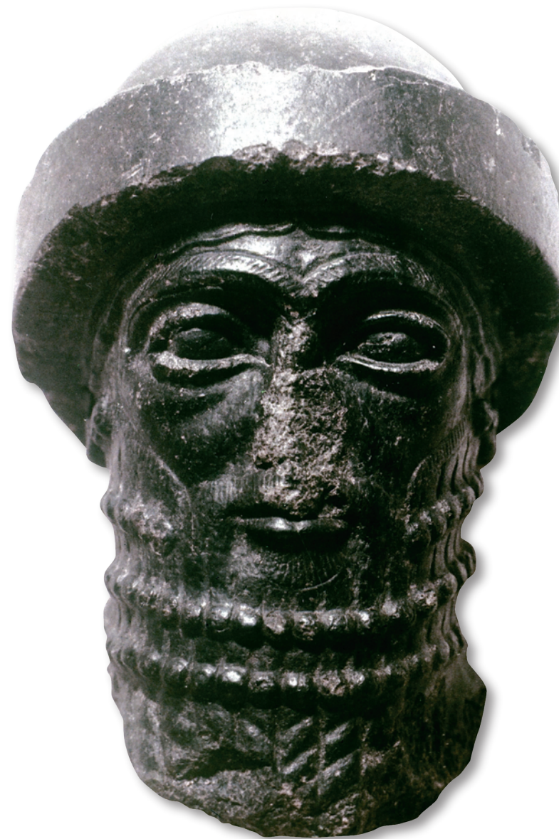
▲ King Hammurabi was a successful leader.

King Hammurabi did a lot to improve life. He built an empire that brought pride to his people. He made laws that gave peace and justice to his empire. He also allowed changes in art, language, and religion. If it were not for Hammurabi, many of these things might not have happened.