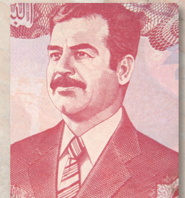
Saddam Hussein ▶

Iraq deals with a lot of conflict today. From 1979 until 2003, Saddam Hussein (sahd-AHM hou-SANE) was the leader of Iraq. He was a very harsh man. In 2003, his government was overthrown by the United States military. Now, the people of Iraq are forming a government. They are working towards being a peaceful country.