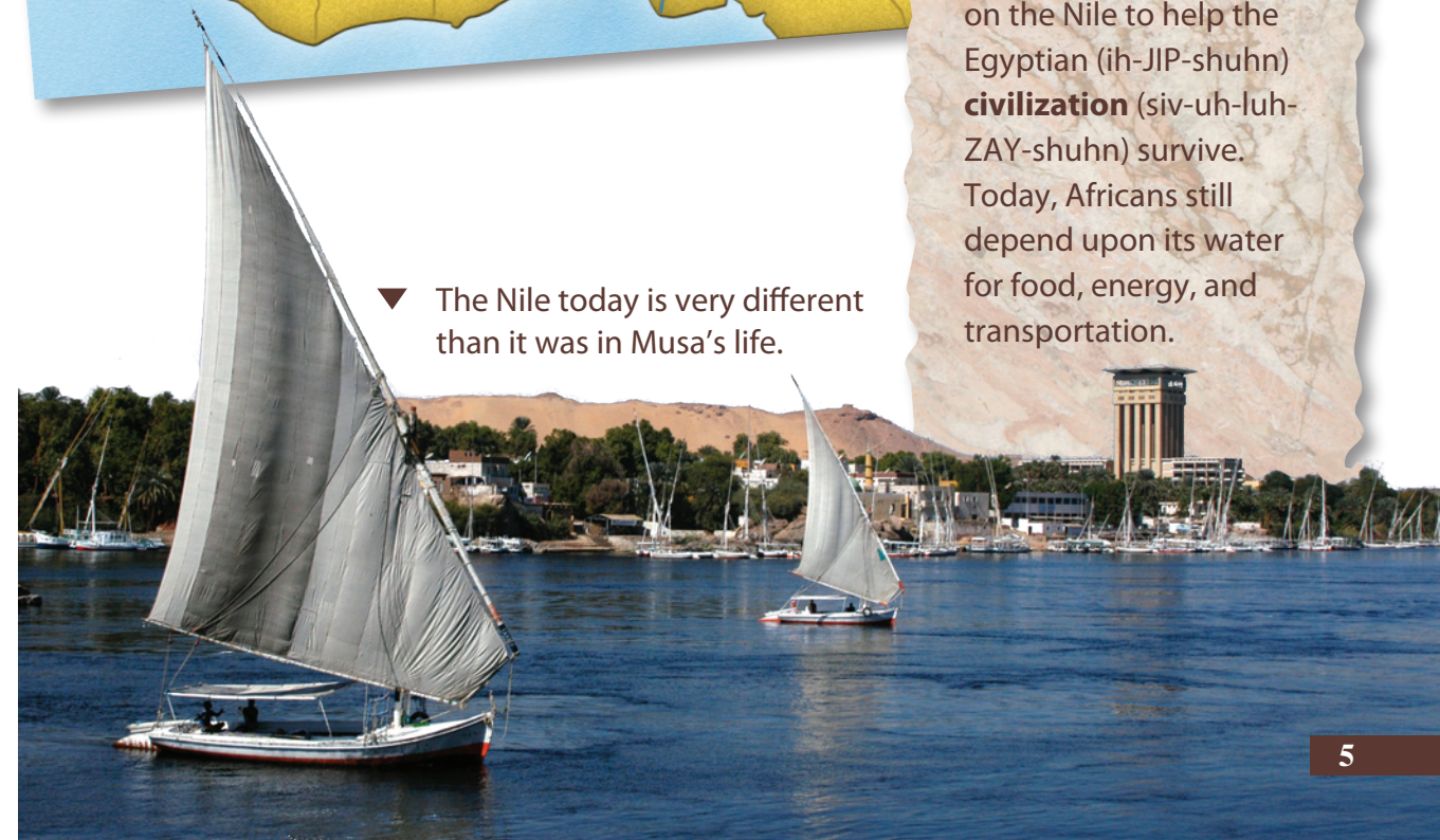
▼ The Nile today is very different than it was in Musa’s life.

The longest river in Africa is the Nile. In ancient times, people relied on the Nile to help the Egyptian (ih-JIP-shuhn) civilization (siv-uh-luh-ZAY-shuhn) survive. Today, Africans still depend upon its water for food, energy, and transportation.