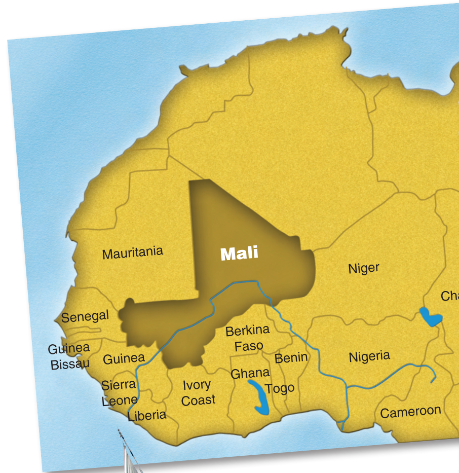
◀ Map of western Africa today