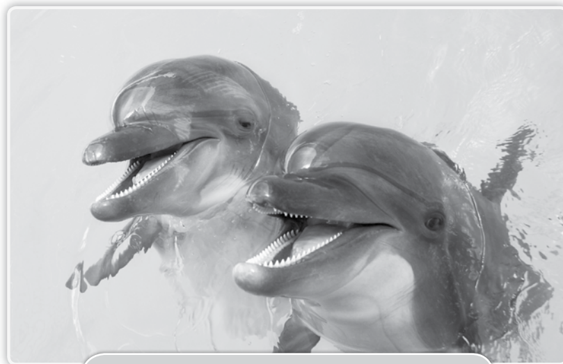
Two bottlenose dolphins "chatting" together.