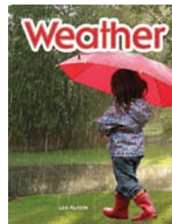
wordless photo book (lap size)