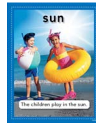
8 vocabulary concept cards with full-color images on the front

The report of the National Reading Panel (National Institute of Child Health and Human Development [NICHD], 2000) evaluated thousands of research studies to develop a comprehensive set of recommendations for effective reading instruction in America’s schools. They identified five essential elements that improve children’s reading achievement: phonemic awareness, phonics, vocabulary, fluency, and comprehension (NICHD, 2000). They argue that a balanced approach to teaching reading that includes all five elements is essential for improving the academic performance of America’s youth. Especially important for preschool children is the development of phonemic awareness. Phonemic awareness is the understanding of sounds and sound patterns in language and includes the ability to manipulate sounds. The National Reading Panel authors (2000, p. 7) note, “[C]orrelational studies have identified [phonemic awareness] and letter knowledge as the two best school-entry predictors of how well children will learn to read during the first 2 years of instruction.”