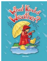
concept book (lap size)

The three types of books (concept, traditional song or rhyme, and wordless photo book) provide children with different genres of text related to the theme. Furthermore, the eight vocabulary concept cards included with each unit provide additional text with photos.